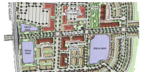
BOLTON RESIDENTIAL VISION + MASTER PLAN