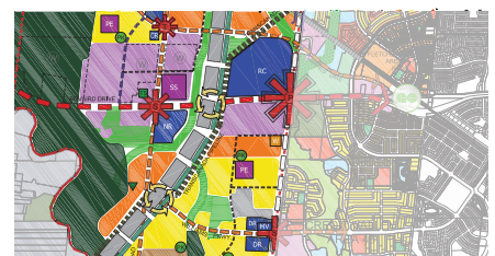
HERITAGE HEIGHTS VISION + MASTERPLAN